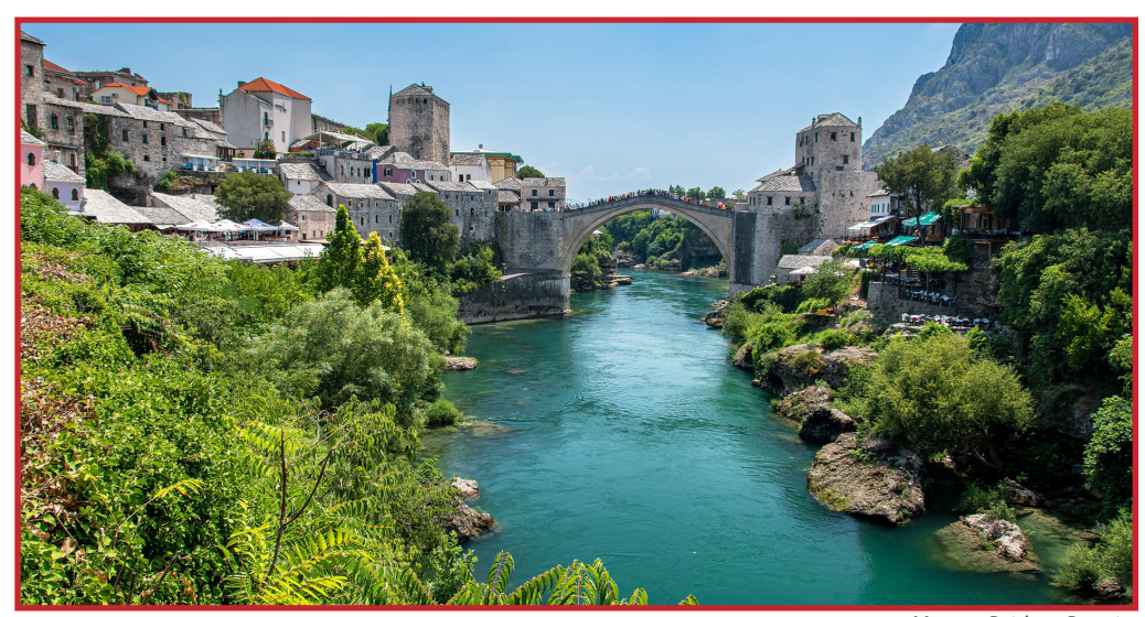
Mostar Bridge, Bosnia

1. https://www.ncbi.nlm.nih.gov/ pubmed/31344627