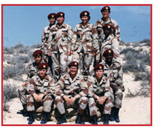
Gulf War Veterans