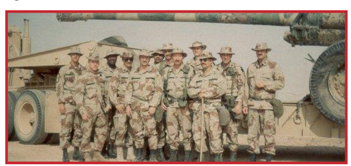
Louisiana National Gaurd, 1991