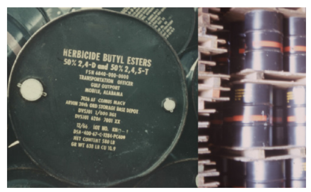
barrels of herbicides

If you believe you were exposed to Agent Orange or other tactical herbicides and have a condition related to exposure to Agent Orange, you can file a disability claim at <u>https://www.va.gov/disability/</u> <u>how-to-file-claim/</u>.