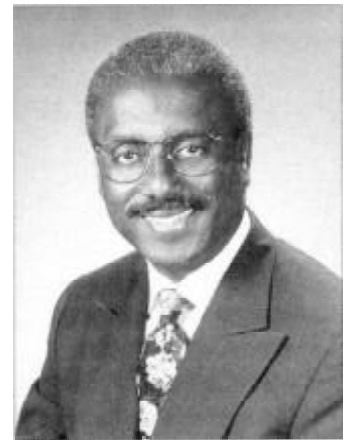
Secretary Jesse Brown

On November 2, 1994, the President signed the "Veterans' Benefits improvements Act of 1994," Public Law 103-446. This law authorized the Department of Veterans Affairs to pay service-connected compensation to Persian Gulf War veterans who are suffering from chronic disabilities resulting from undiagnosed illnesses. VA recently published the final regulation implementing the authority granted by the statute.